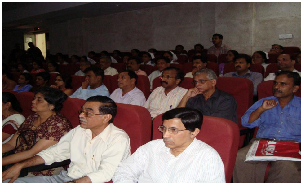
Plate 4: Audience present for the “Regulatory and Technological Aspects of Bio-Medical Waste Management”