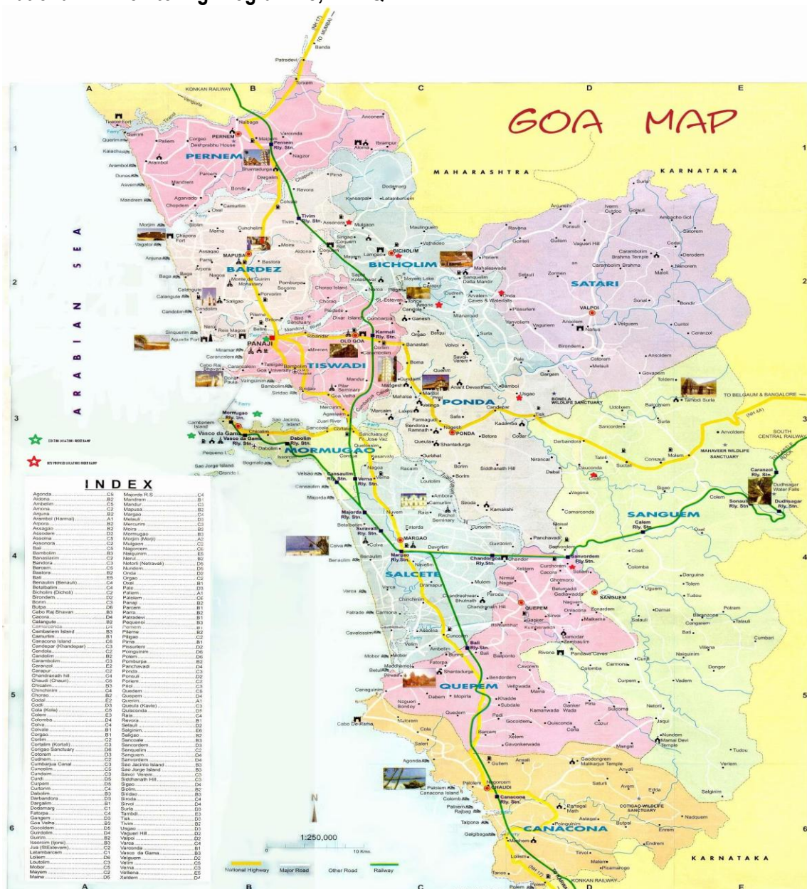
Figure 2: Map of Goa showing the Ambient Air Quality Monitoring Stations under the National Air Monitoring Programme; NAAQM

Figure 2 below is a map of Goa showing the existing and proposed ambient air quality monitoring locations under National Air Monitoring Programme; NAAQM. The existing monitoring locations are indicated in green and the proposed locations are indicated in red.