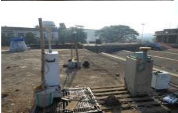
Plate – 3 c: View of the PM10 and PM2.5 Samplers placed at the NAMP Monitoring Station at Mapusa, Goa