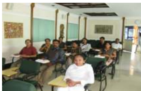
Plate 4 – b : View of GSPCB staff attending a lecture session