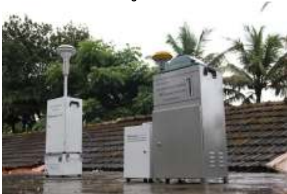
Plate – 3 a: View of the PM 10 and PM 2.5 Samplers placed at the NAMP Monitoring Station at Tilamol Quepem, Goa.

Views of the 5 new monitoring locations established under this project are shown in the following pictures.