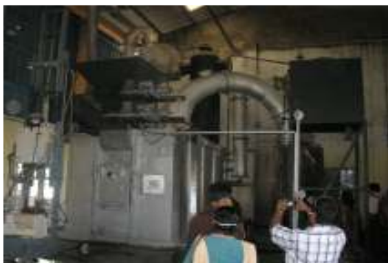
Plate 4 – c: View of Hazardous Waste Treatment site of M/s. Ramky at Taloja