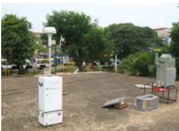
Plate – 3 d: View of the PM10 and PM2.5 Samplers placed at the NAMP Monitoring Station at Margao, Goa