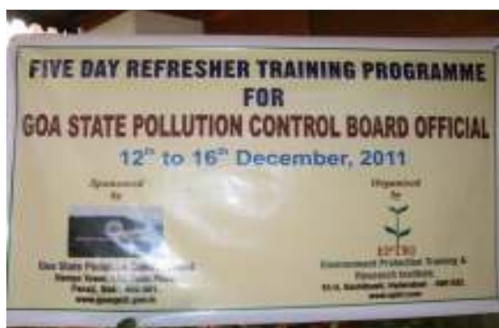
Plate 4 – a : View of the Banner indicating the training programme