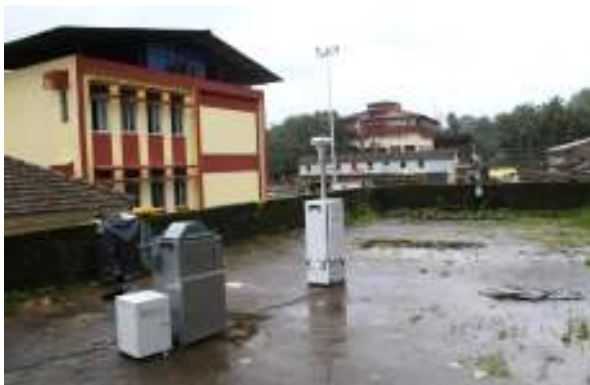
Plate – 3 b: View of the PM10 and PM2.5 Samplers placed at the NAMP Monitoring Station at Sanguem, Goa.