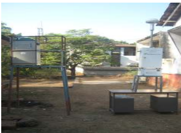
Plate – 3 e: View of the PM10 and PM2.5 Samplers placed at the NAMP Monitoring Station at Ponda, Goa

Figure 2 below is a map of Goa showing the existing and the new ambient air quality monitoring locations under National Air Monitoring Programme; NAAQM. The existing monitoring locations are indicated in green and the new locations are indicated in red.